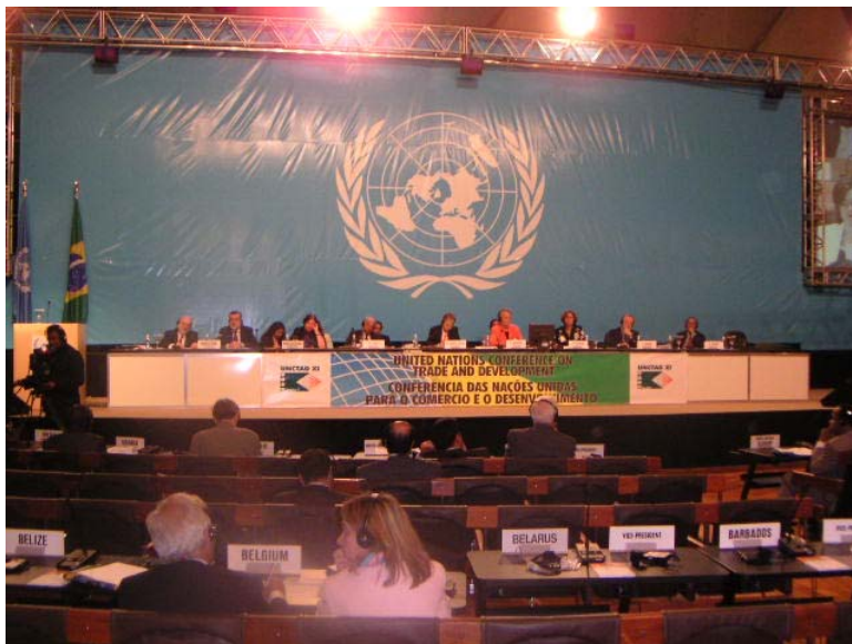
Joint UNCTAD/WAIPA High-level session, Sao Paulo, Brazil, 15 June 2004

The ninth Annual Conference of WAIPA was held in Sao Paulo, Brazil, from 15 to 16 June 2004 as a parallel event to the eleventh session of UNCTAD. As in the case of the Expert Meeting, the Conference was preceded by a two-day (13-14 June 2004) training workshop facilitated by Pro-Invest on "How to Promote and Target FDI into Tourism and Benefit from it". The main objective of the event was to develop an appreciation among participants from the ACP region of the role of tourism in generating sustained growth and of the nature, design and development of investment promotion strategies for attracting FDI into this sector.