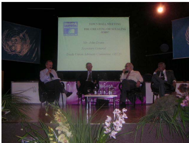
Town hall meeting, Sao Paulo, Brazil, 16 June 2004

The afternoon sessions on 16 June 2004 focused on programmes encouraging national firms to invest abroad. Public and private sector speakers from Europe emphasized the many benefits of outward investment for national companies and home country economies. It was also stated that outward IPAs play an important complimentary role vis-à-vis inward IPAs in facilitating the investment process and in providing aftercare.