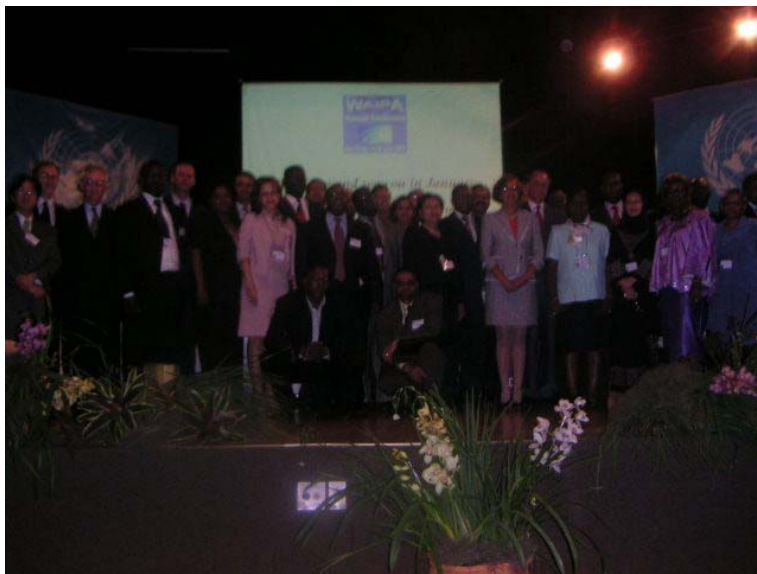
Participants at the ninth WAIPA Conference, Sao Paulo, Brazil, 16 June 2004