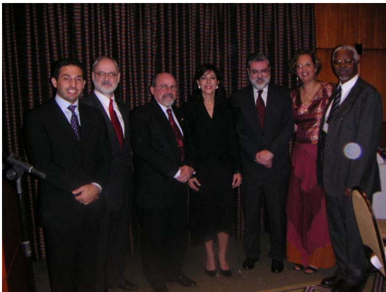
WAIPA Gala Dinner during the first day of the Conference, Sao Paulo, Brazil, 15 June 2004

A Gala Dinner sponsored by the Dubai Development and Investment Authority (DDIA) was organized on the evening of 15 June. The WAIPA awards for Best Business Linkages Programme were presented during the dinner to the Thailand Board of Investment (BOI) for the Industrial Linkage Development Unit, the Ghana Investment Promotion Centre (GIPC) for its Oil Palm Out-grower Scheme and to the Industrial Development Institute of Minas Gerais (INDI) in Brazil for its "Buy in Minas" programme. Winners were selected on the basis of a survey of 123 IPAs from 109 countries undertaken jointly by WAIPA and UNCTAD secretariats.